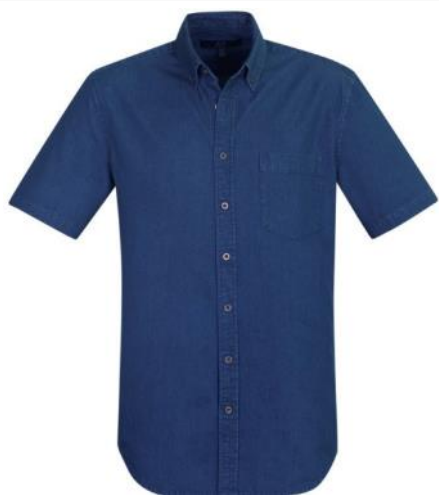
Mens Short Sleeve