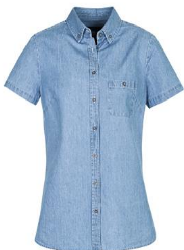
Ladies Short Sleeve