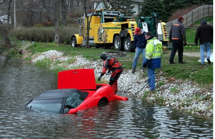
CORVETTE FOR SALE....No smoke damage