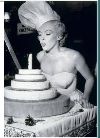
HAPPY BIRTHDAY ..... .....MR PRESIDENT

Corvette Club of South Australia Inc presents