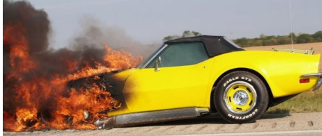
Hot C3 !!!