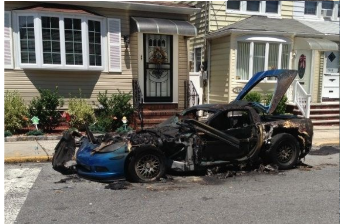
CORVETTE FOR SALE....Minor smoke damage