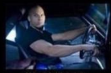
What I think I do.