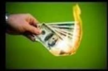
What my family thinks I do.