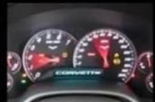
What my friends think I do.