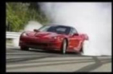
What society thinks I do.