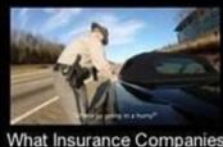
What insurance Companies think I do