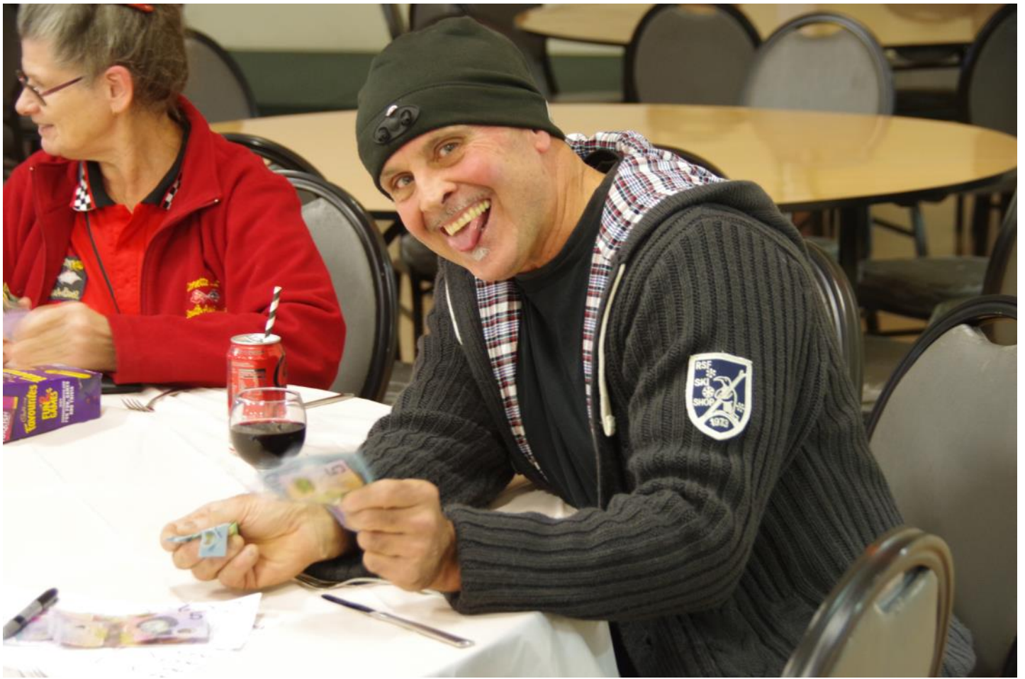
The Godfather making sure everyone has paid their dues