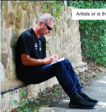
Artists or is that B.S. Artists?