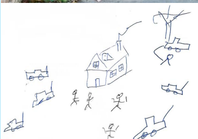
Larry's sketch.....aka chook scratching!