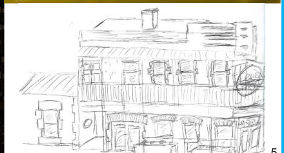
Bob's winning masterpiece