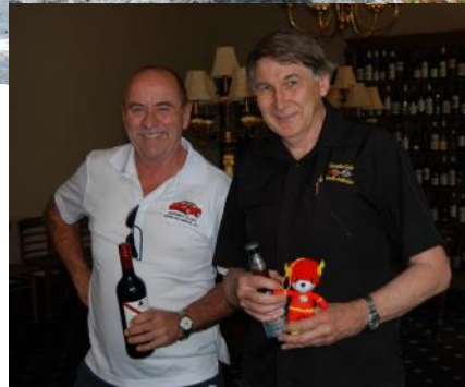
The Prize Winners