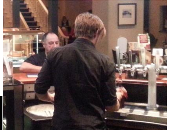
Is this fella old enough to be served? He can hardly reach over the top of the bar!!