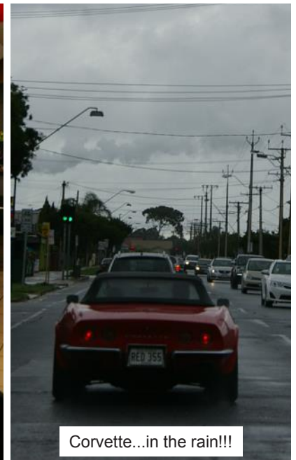
Corvette...in the rain!!!