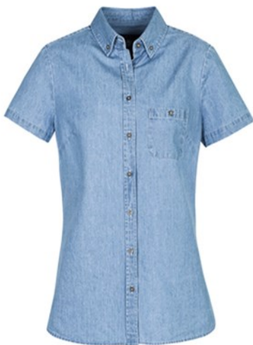
Ladies Short Sleeve