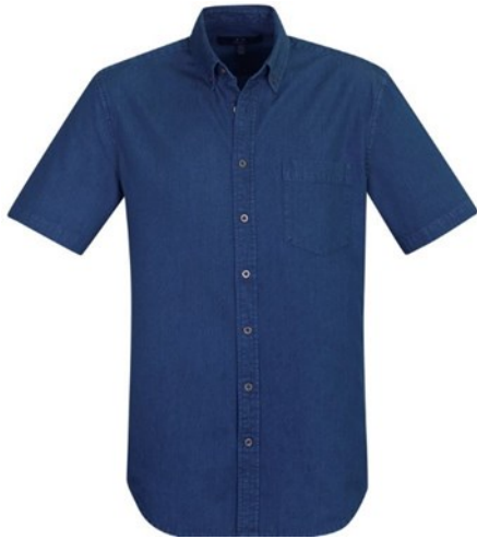
Men's Short Sleeve