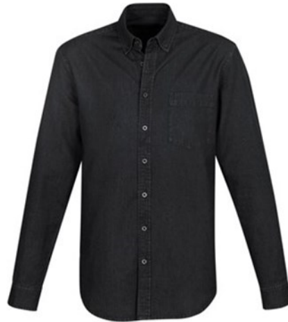
Men's Long Sleeve