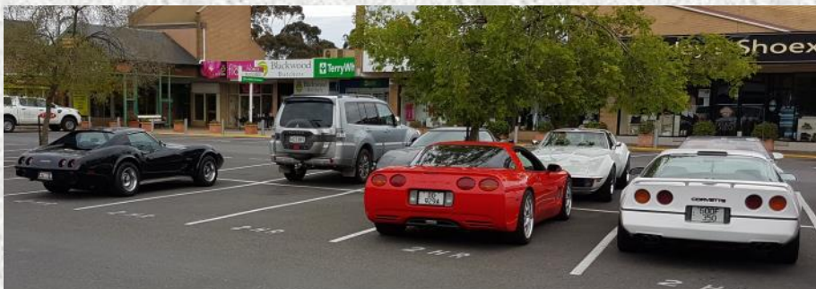
Article and photo's by T Beer-Smith