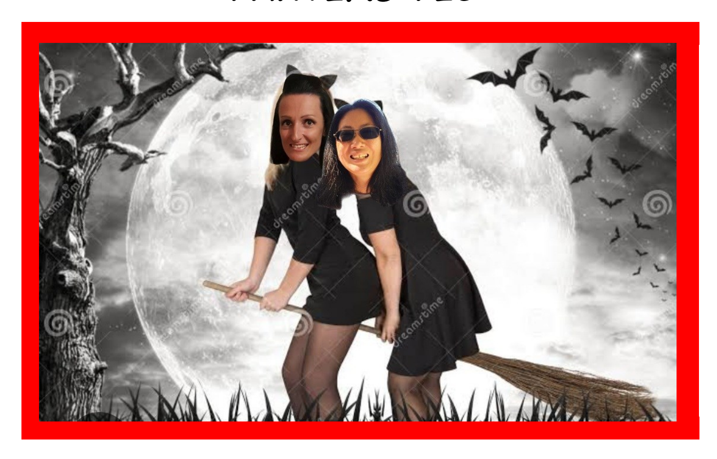
HAPPY HALLOWEEN EVERYONE