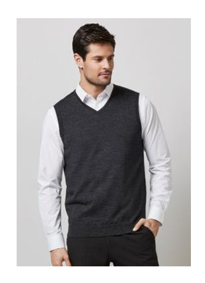
Modern fit - not oversized, designed to look smart. Ribbed "V" neckline, armhole/cuffs and hem. Machine washable. 73% Viscose, 27% Nylon - 12 Gauge. Available in Black, Charcoal or Navy. Sizes S – 4XL

V-Neck Knit Ladies Vest (not shown) - $75 Modern fit: available in Black, Charcoal or Navy. Sizes S – 4XL