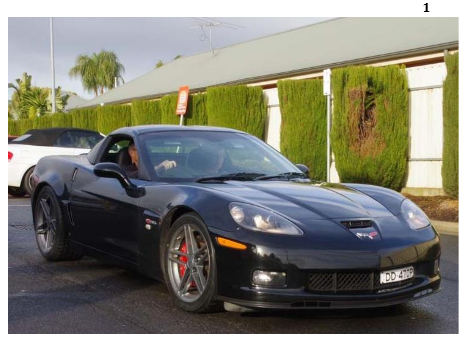
HELLO FROM THE EDITOR