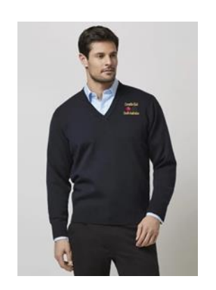
Mens Woolmix Pullover - $85 50% Wool, 50% Acrylic - 12 Gauge. Machine washable on wool setting. Easy Fit. Contemporary V-neck style features ribbed side panel detail. Available in Black, Charcoal & Navy. Sizes S - 5XL