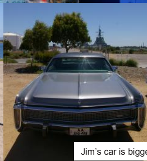
Jim's car is bigger than the warship