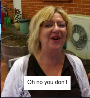
Oh no you don't