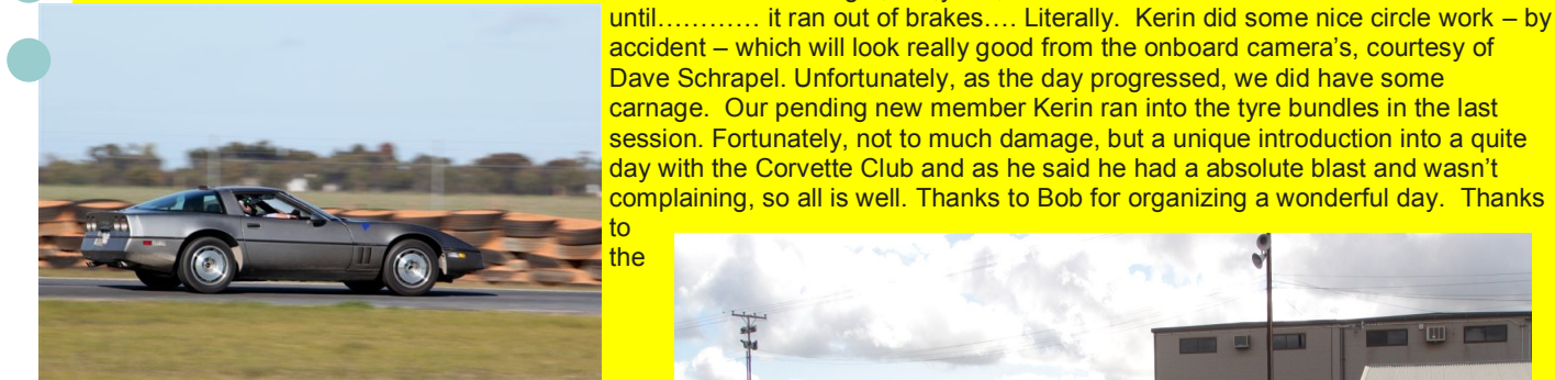
other club members for coming out to watch with their cars and allowing an impromptu photo shoot. And thanks to the Porsche Club and their members for making us feel welcomed to their day at the track.

their lights all ready for scrutineering. As bob is a veteran Mallala driver, he and a couple of the porsche club drivers took the boys out for a couple of laps, giving them helpful hints and showing them the apex's of the track. After successful scruteneering, they were all set to go. There was an allocation of 2 practice sessions each of 4 laps and 3 'go for it sessions' each of 4 laps. Due to bobs racing history, they didn't put him in with our group, so he could guide and help the others if needed which is a bit hard when you are on the track at the same time! First practice session, our black beast said "You want me to do what....?" and ended up coughing and sputtering on the back straight. After then, it would not rev, so Jim came straight in. It must have then thought, "oh, yeah, I can do this' and was fine after this